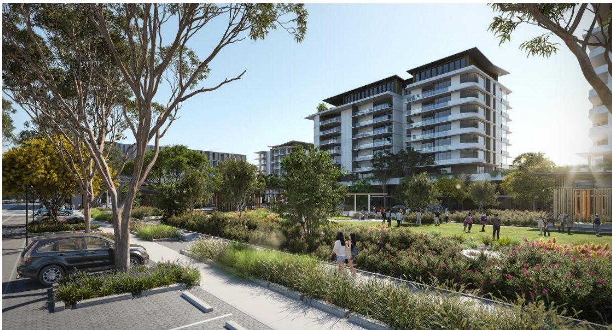
Figure 2: Artist's impression of proposed Lendlease residential aged care facility.

IDS-10 was initiated in Semester 1 2021 (1 st March) with semester work running for 13 weeks until the beginning of June 2021. Following the studio, the consultants completed a vetting process extracting the design ideas produced throughout the studio and examining for potential performance improvements. The conclusion of this analysis was output into a vetting report, contained within the final design studio outcomes report.