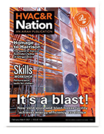
HVAC&R Nation • February 2021

As part of the i-Hub initiative, two Living Labs in Queensland are paving the way for more energy-efficient and effective hospitals and aged-care facilities.