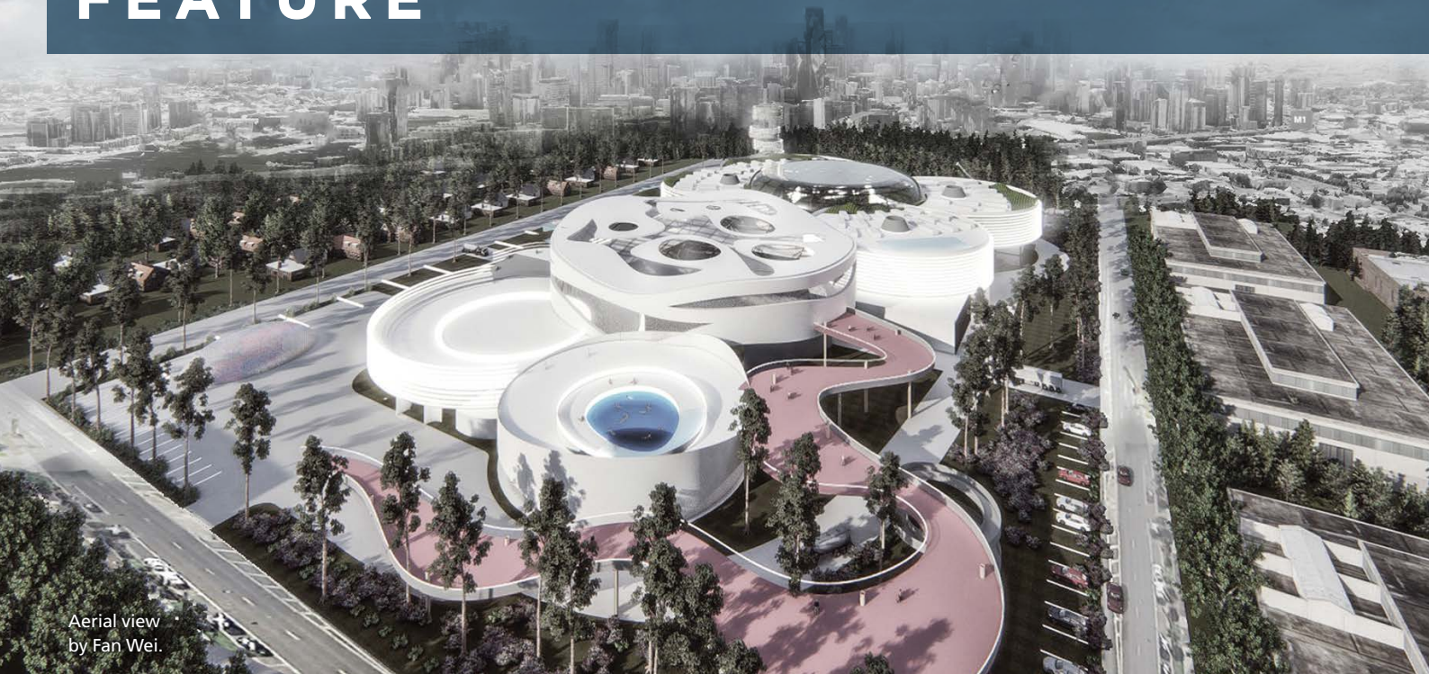
Aerial view by Fan Wei.